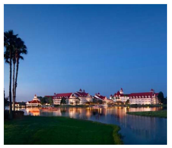
Disney's Grand Floridian Resort & Spa